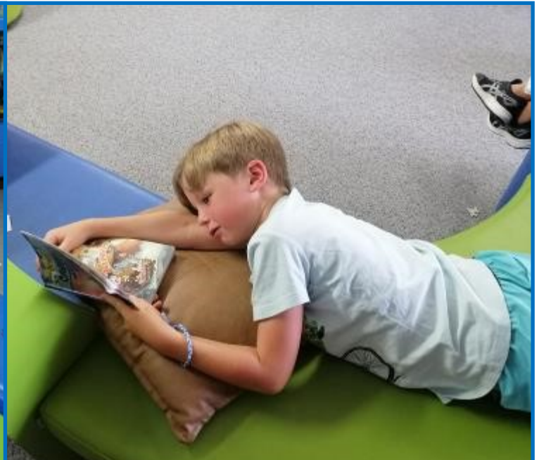
Pod 2 enjoying cooling off and getting ready for our swimming sport races. Finishing the week relaxing and reading in the library.